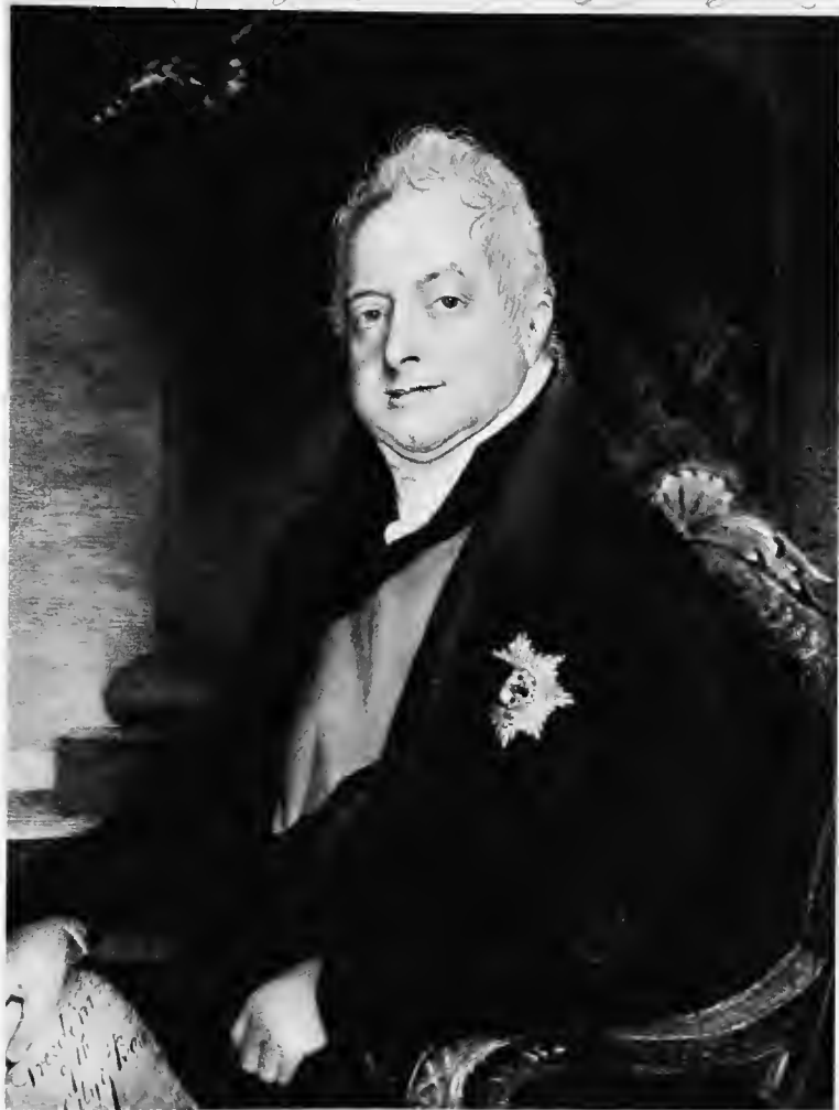
H. M. King William IV From the miniature at Windsor Castle